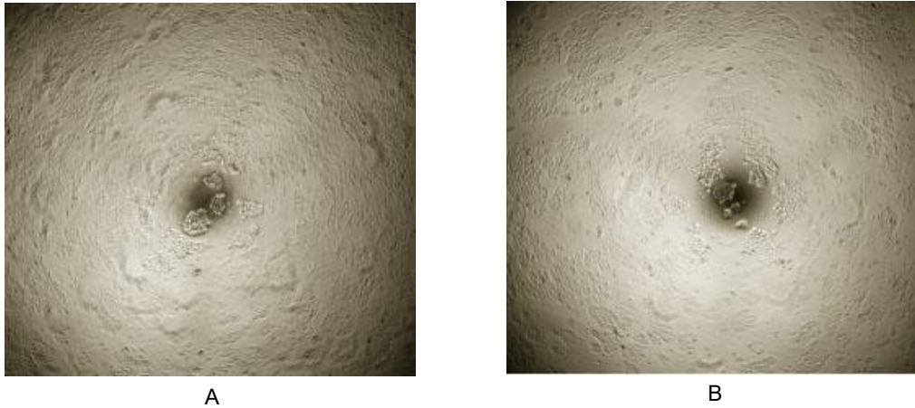
Figure 1. Cell proliferation of MCF-7 cells after stimulated with INS.

(A) MCF-7 cells cultured in DMEM, stimulated with 100ng/mL INS for 72h;