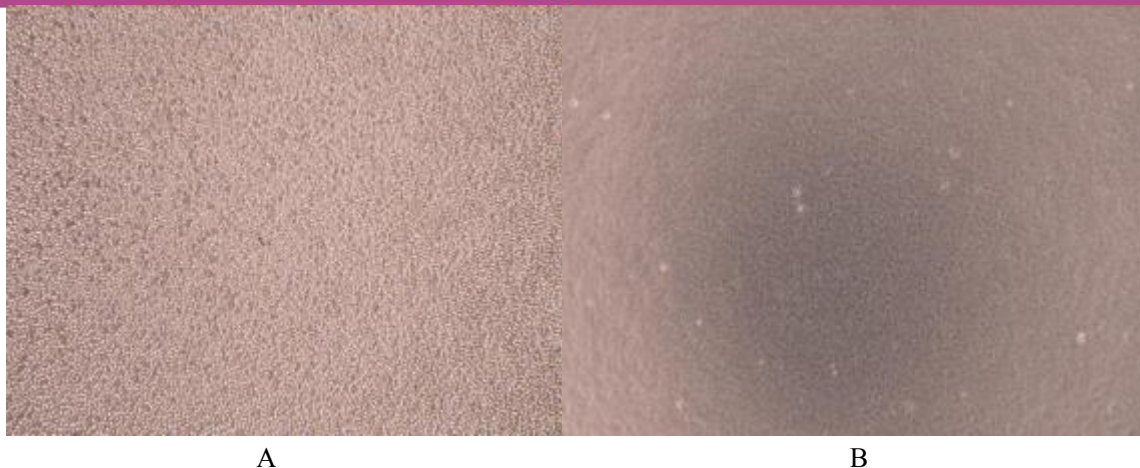
Figure 1. Hemolysis activity of recombinant rat PRF1

(A) 0.25% RaE tread with 7.5µg/ml PRF1 for 20h;