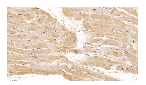
DAB staining on IHC-P; Sample: Human Cardiac Muscle Tissue; Primary Ab: 40µg/ml Mouse Anti-Human CTGF Antibody Second Ab: 2µg/mL HRP-Linked Caprine Anti-Mouse IgG Polyclonal Antibody (Catalog: SAA544Mu19)