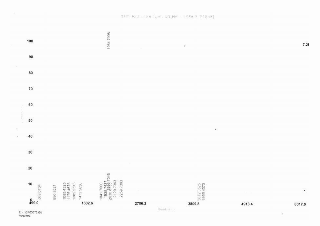
Figure 2. MASS Spectrometry of the Original Peptide