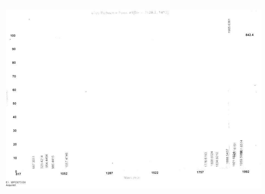
Figure 2. MASS Spectrometry of the Original Peptide