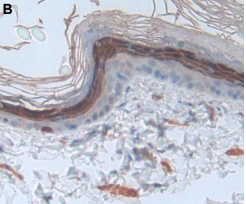
Figure 2. DAB staining on IHC-P