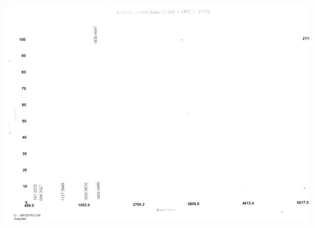
Figure 2. MASS Spectrometry of the Original Peptide