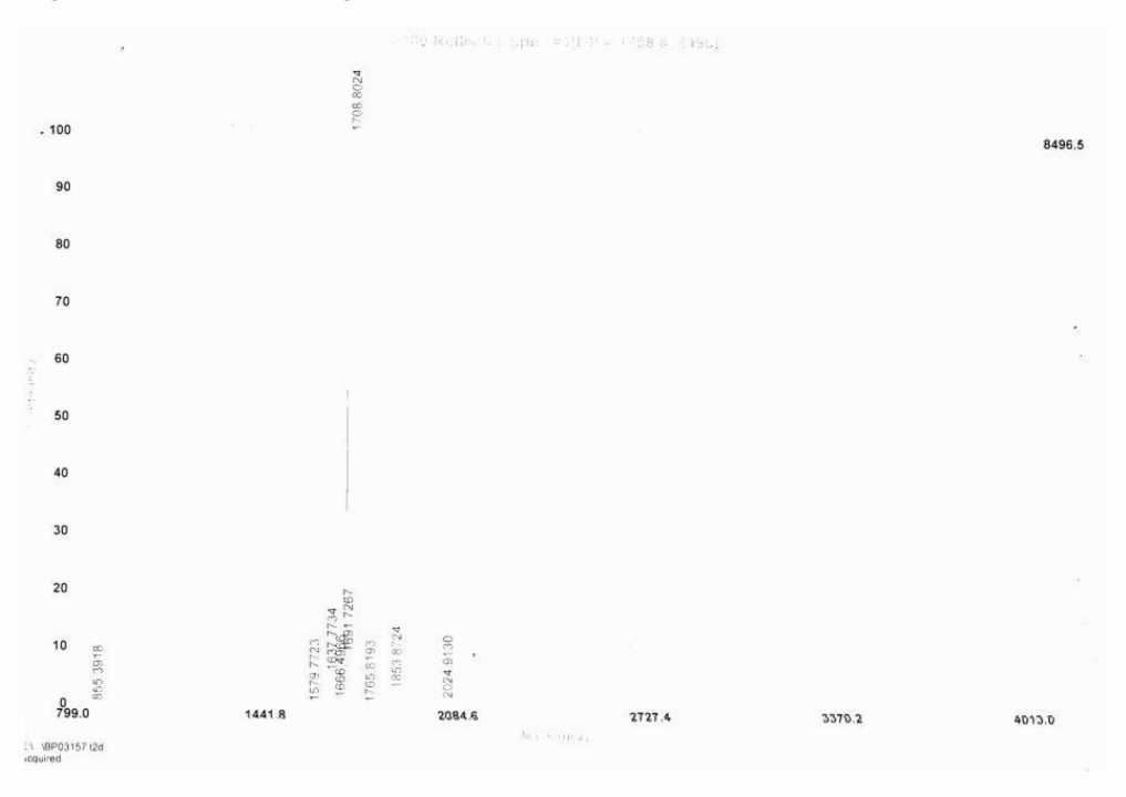
Figure 2. MASS Spectrometry of the Original Peptide