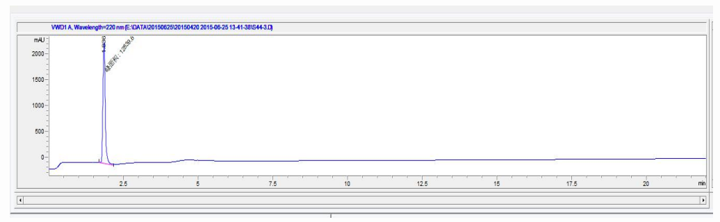
Figure 1. HPLC of the Original Peptide